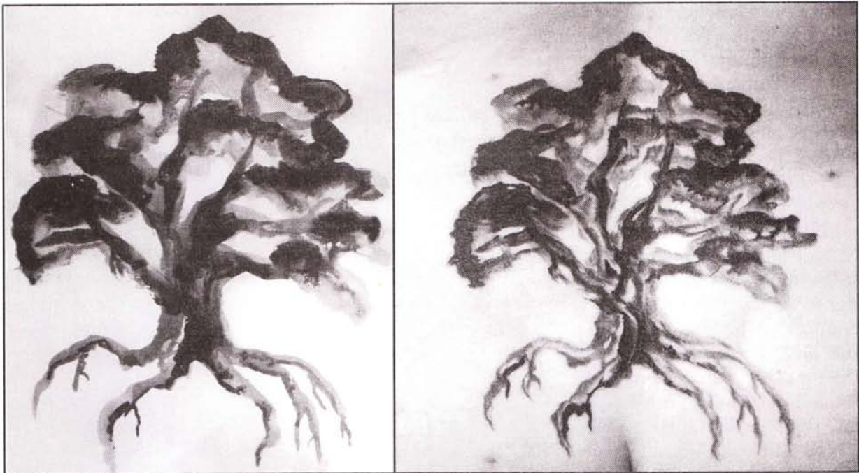
Another look at the transition from one canvas to another: A brushstroke tree (left) becomes a tattoo (right).

friends who already loved my work, so I started out tattooing doing a lot of custom work and unique designs.